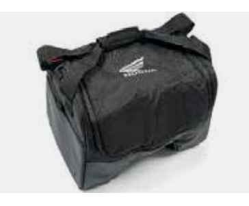
INNER BAG FOR 38L TOP BOX 08L75-MJP-G51

Black nylon bag with embroidered silver Honda wing logo on the top and red zippers. Comes with adjustable shoulder belt and carrying handle.